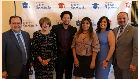
"Changing Faces" lecture at East Los Angeles College

We published Left Out: How Exclusion in California's Colleges and Universities Hurts Our Values, Our Students, and Our Economy and hosted a lecture series inviting prominent racial equity champions to discuss the importance of inclusion in higher education leadership.