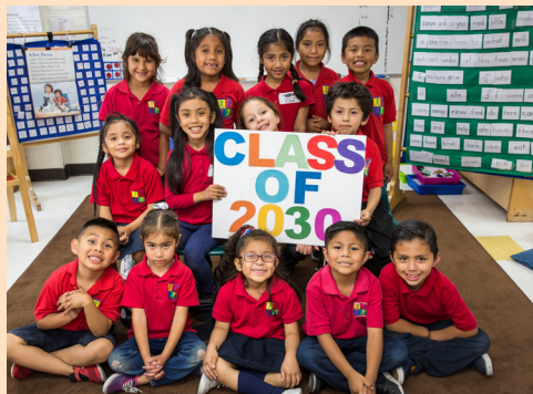
Future College Students Para Los Niños Class of 2030