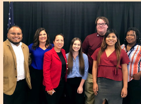
Student cohorts with Eleni Kounalakis at our Lt. Governor candidate townhall

We ensured higher education was a central topic in the 2018 election by hosting townhalls and forums on higher education with the leading candidates for Governor and Lt. Governor. We also launched Our California , a campaign calling upon our Governor to create a bold new vision for higher education that includes a 60% attainment goal for California adults by 2030, makes the necessary investments in higher education, and supports reforms that ensure the success of our students.