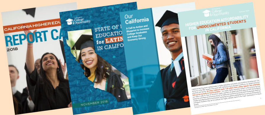
California Higher Education Report Card 2018