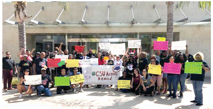
Student and community organizations rally outside of the CSU Board of Trustees meeting.

In coalition with over 100 K-12 school districts and civil rights, business, education, and community organizations, we have opposed a harmful policy that would restrict access to the California State University (CSU) and make it more selective than ever before. Our coalition activated legislators and elected officials, including members of the California Legislative Black and Latino Caucuses, Superintendent of Public Instruction Tony Thurmond, Lieutenant Governor Eleni Kounalakis, and CSU Board of Trustees members to raise concerns about admissions changes at the CSU.